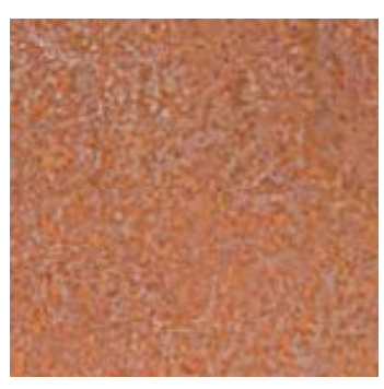
Rusteel Plus™ (A606 Corten) Stainless Steel