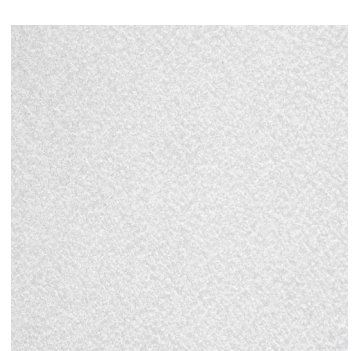
Zincalume/Galvalume SRI-65 Galvanized SRI-65